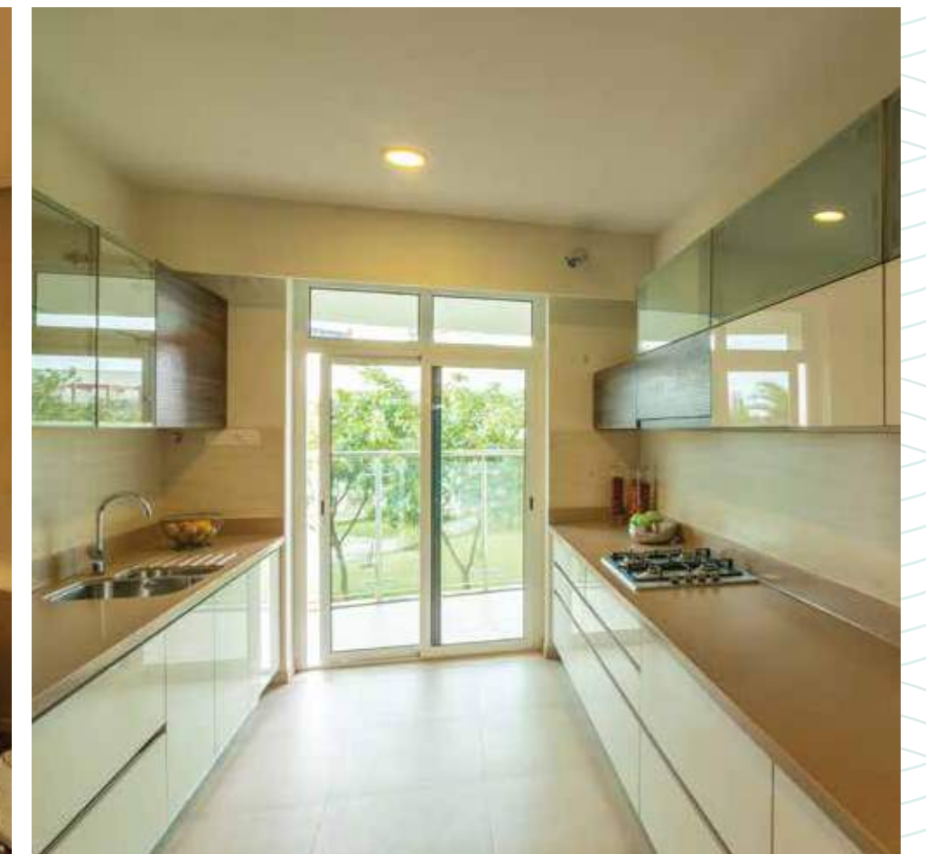
Actual image of show-flat shot on 29.09.2020