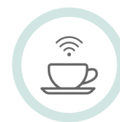
Outdoor Cafe with WiFi