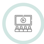
Open Air Theatre